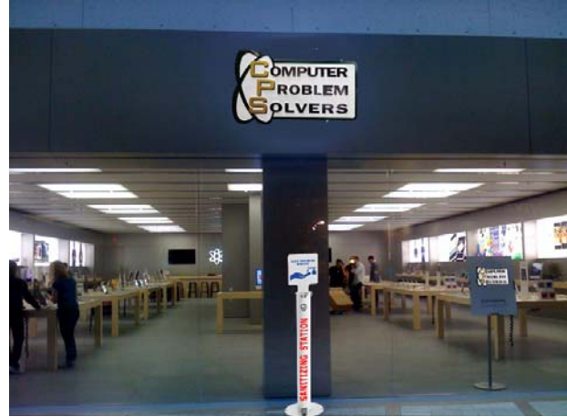
RETAIL & COMMERCIAL