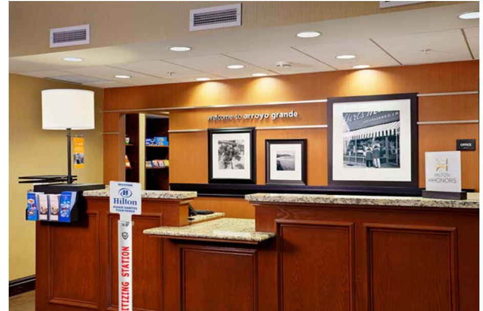
OFFICE & HOSPITALITY