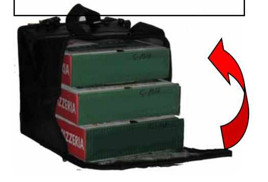
Front loading thermal bag for your take out orders.